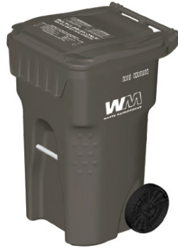
Recycle- Gray Cart