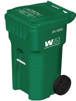
Green Waste- Green Cart