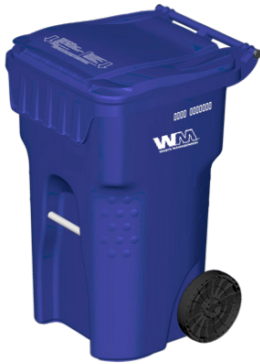
Trash- Blue Cart